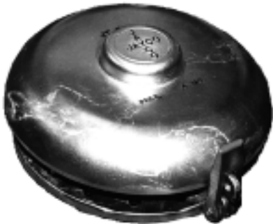
Model JT-8 SS Round Thief Hatch